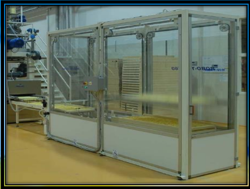
TRAYS STACKING MACHINE